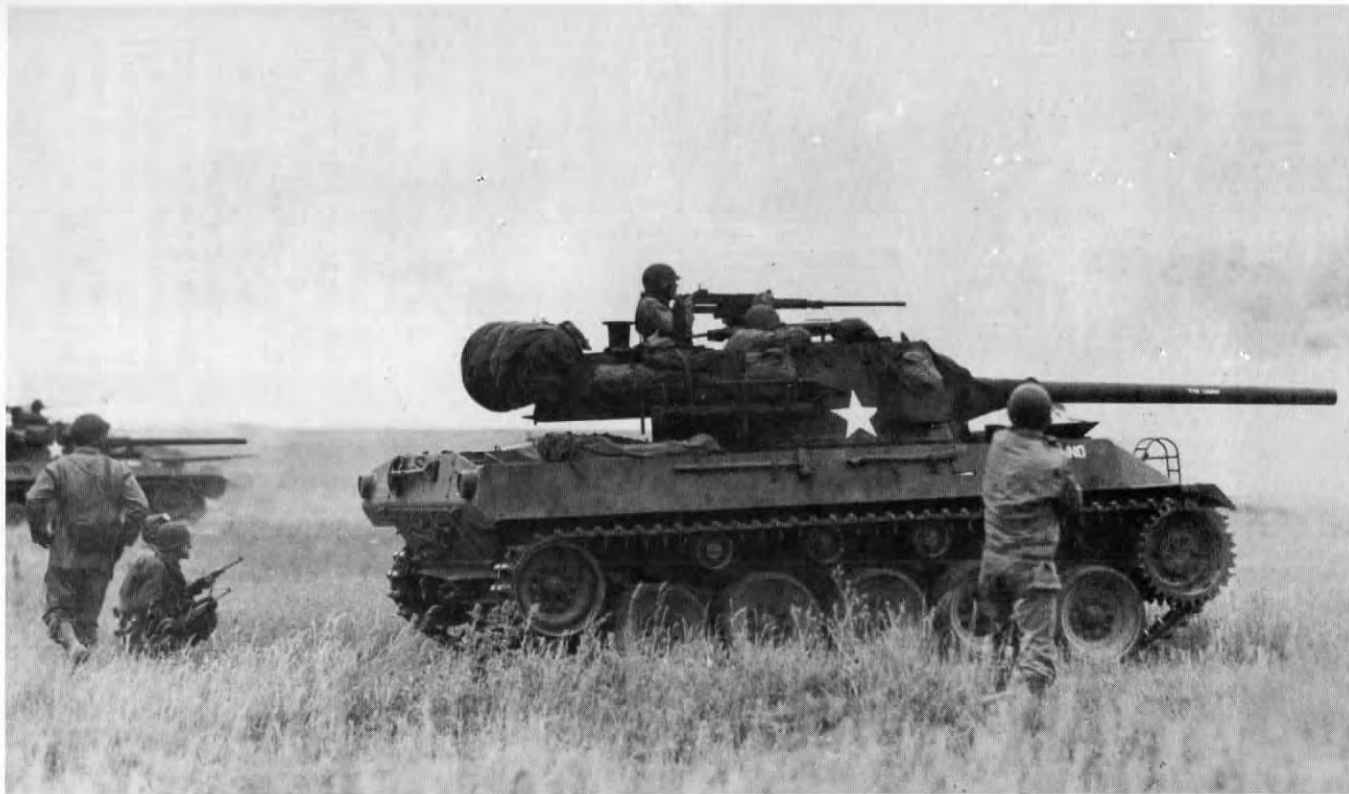
Tank destroyer crews perfect their skills during training in England. These uncluttered Hellcats of the 603rd TD Battalion provide a good look at M18 armament, stowage and markings, including "THE COBRA" painted on the 76mm barrel in the foreground. Reels of signal wire are stowed on the turrets behind the vehicle commanders manning the machine guns.