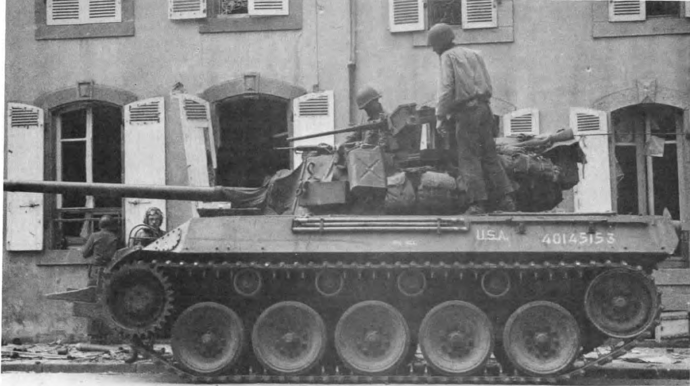
The principal combat vehicle used by the 704th Tank Destroyer Battalion was the 76mm Gun Motor Carriage M18, popularly known as the "Hellcat". The vehicle in this photo is from an unknown battalion and was photo'ed at Brest, France on September 12, 1944. Note the unusual stencil "USA" number and nickname "BIG GEE", as well as the Cullin hedgerow cutter fastened to the hull front.