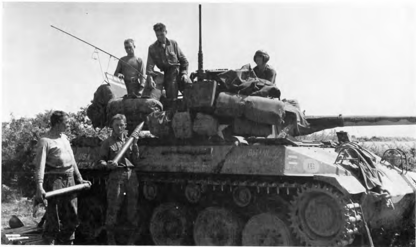
An M18 crew pitches in to finish the backbreaking task of reloading 76mm ammo near Brest, France. Note the unusual light grey camouflage applied to the lower portion of the gun tube — reminiscent of that used by the British to disguise the long barrels of their Sherman Fireflies. Separate names on both gun tube and hull are fairly common on US AFVs. The exhaust pipe for the auxiliary generator is visible to the right of the Ax.