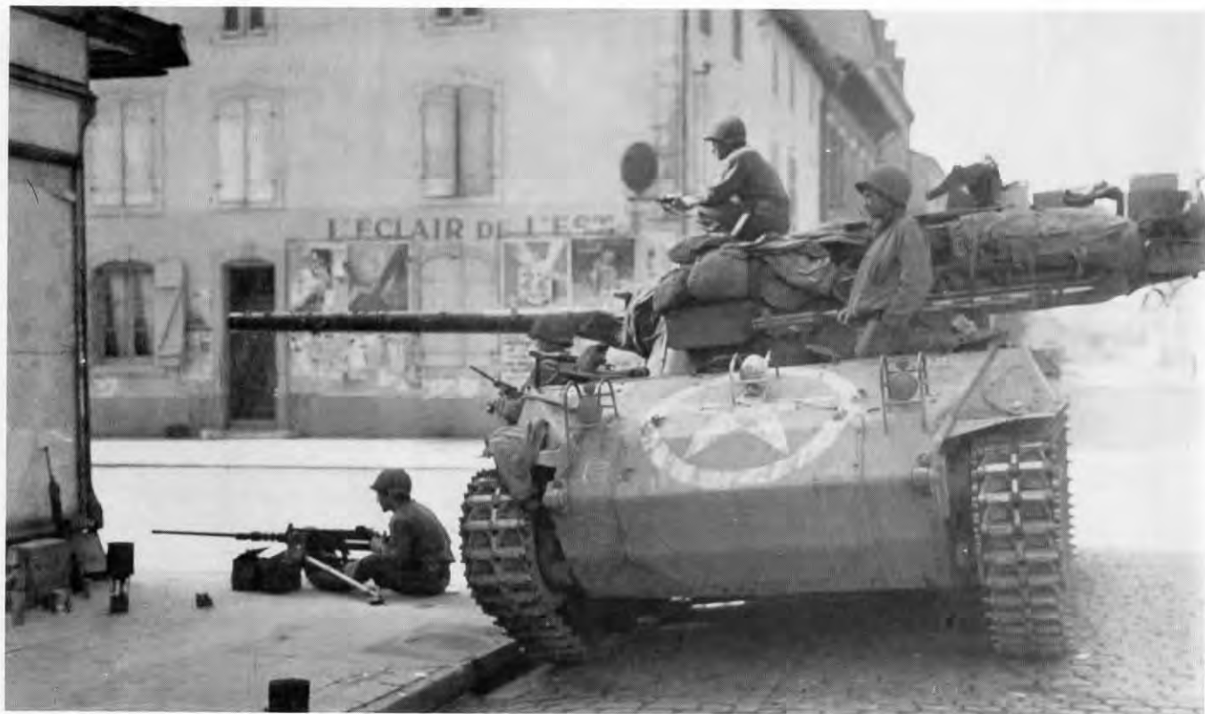
Events down the street cause the crew of this Hellcat to man their guns. The ration boxes and .50 caliber machine gun dismantled from its turret ring-mount indicate that they plan to stay awhile. Although the censor has obliterated the unit markings, details of the siren, headlights and panel allowing access to the transmission are readily visible.