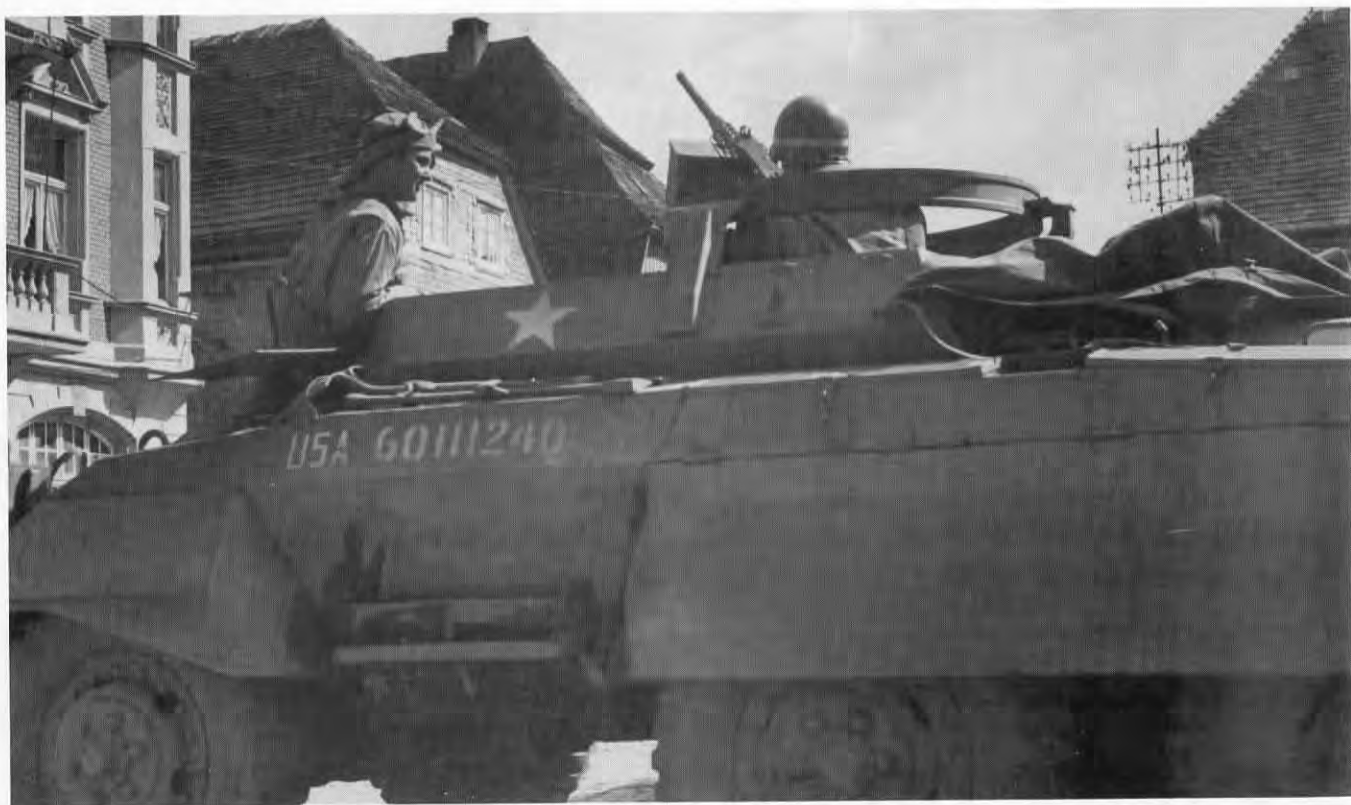
An M20 Armored Utility Vehicle stands AA Watch. The lightly armored M20 equipped the security sections of Tank Destroyer gun platoons. It was armed with a ring-mounted .50 caliber machine gun and a bazooka, stowed in the open crew compartment, for its four man crew. Derived from the M8 armored car, the M20 was capable of 56mph on a good road, and reasonable cross-country performance when using six-wheel drive.