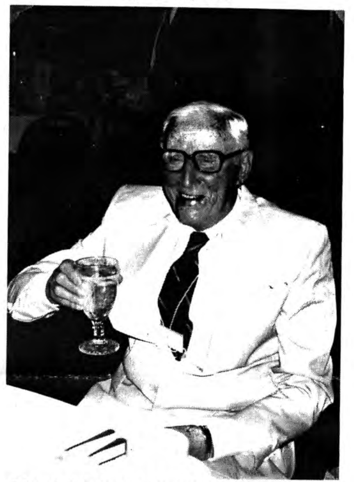
At The Reading, Pennsylvania Reunion Way 17-19, 1992