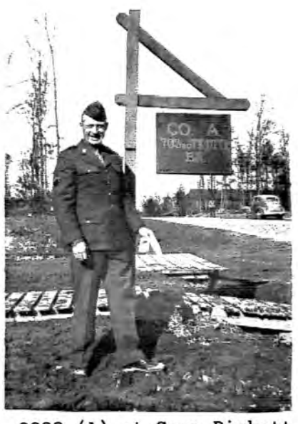
???? (A) at Camp Pickett