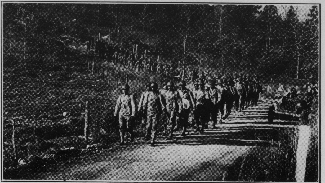
Soldiers training at Fort Huachuca completed day-long hikes without leaving the reservation. They had their pick of terrain for hiking.