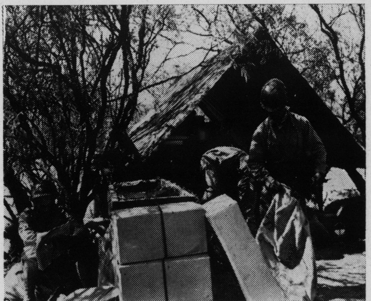
Maneuver areas on the huge Post are plentiful and afforded opportunity for learning varied battle techniques.