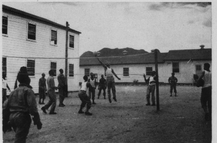
Recreation facilities are plentiful in barrack areas . . . ball diamonds, basket and volley ball courts, horse-shoe pits and tennis courts.