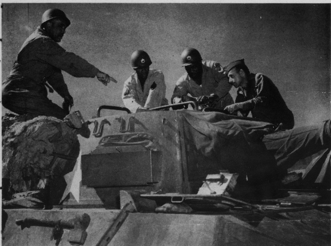
The 827th Tank Destroyer battalion learned its weapons in Huachuca's mountains.