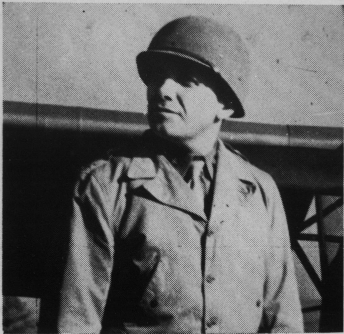
Major General Edward M. Almond commanded troops of the 92nd Division during training at Fort Huachuca.