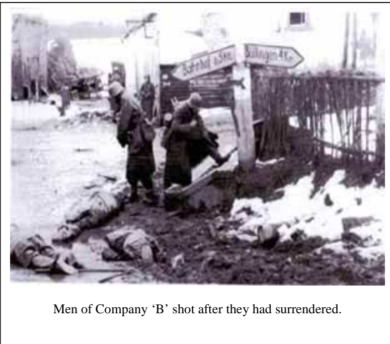
Men of Company 'B' shot after they had surrendered.

of the men were already standing along side of the tanks with their hands over their heads. One tank fired just as I got to the steps and knocked down about five men. A friend of mine had both legs shot out from under him. As he was calling for help, the tank swerved to the left and ran over him. It went right by me and kept going.”