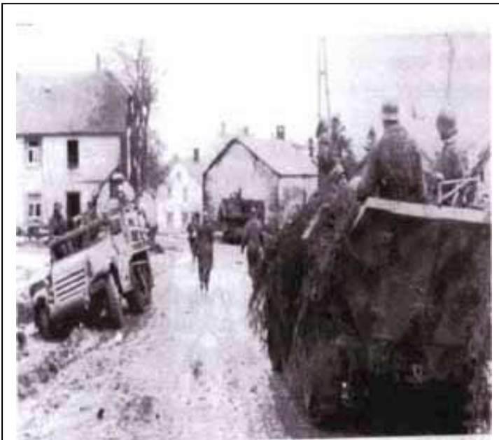
Kampfgruppe Peiper entering Honsfeld. The half-track on the right is part of the 14 th Calvary squadron.