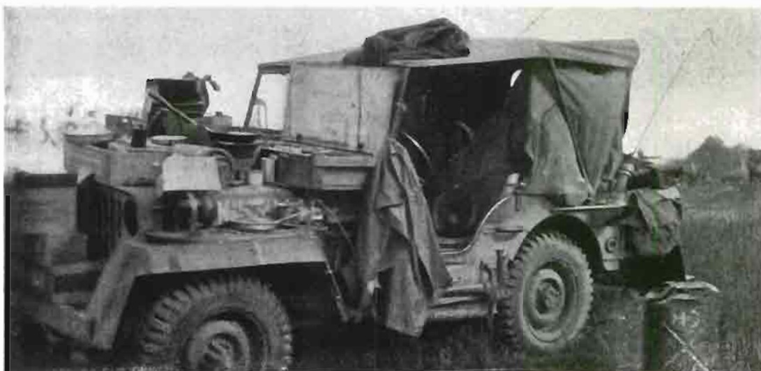
Jeep. Combat Loaded, Near Salzwedel, Germany

On February 7th, 1944, Company "B" debarked from the Acquitania near Upper Glasgow, Scotland. A long but enjoyable train ride took the Company to Packington Park, located in central England, between Birmingham and Coventry. There, additional equipment and vehicles were issued and a training period started. Later the organization moved to Wales,