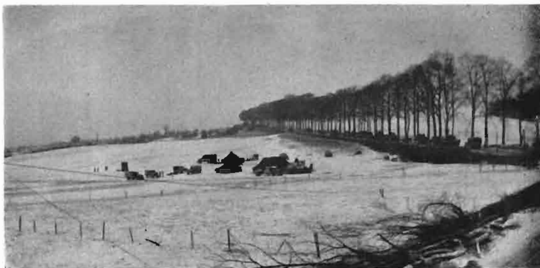
Aid Station, Near Bomal, Belgium. Dec. 1944

— but on and on — Senlis, Mantes, Compiègne Forest, Paris, Noyon, Valenciennes, Conde, Belgium; cities one never dreamed of seeing; La Victoria, “Vive les Americans”, “Vive les Allies”, were the cries of the liberated. More fighting, on and on until finally the words “Vive les Allies” died out: in its place was “Ich nich Nazi”; so was our campaign through France and Belgium. The move continued to the border of Luxembourg, the next country for liberation.