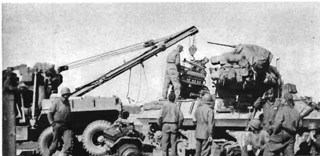
Changing A Tank Motor Near Elbe River

and on 17 March 1944, we moved to Brecon Range, South Wales, for firing. We fired approximately 2000 rounds, and had a firing test that proved successful. On 3 April we moved out via Packington Park to Dorchester, England. It was here that the company was used to marshall troops who were to participate in battle on "D Day". We stayed here until 6 of July at which time we moved to Camp D2 near Bournemouth. Here we put new tracks on, greased our tanks, drew our basic load of ammunition and moved into a marshalling area. Leaving this area on the second day, we loaded ship and crossed the English Channel on our way to France. Arriving on the Continent on 29 July 1944 Company "C" was ready for battle. As being appropriate they started singing the song which they had adopted way back in 1941. The words of which are: