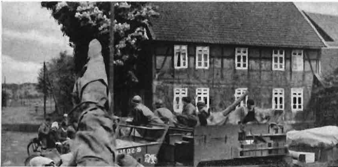
Convoy Near Pufferdorf, Germany

encountered an enemy patrol near Sees. After a short but brisk skirmish of small arms fire, they returned to bivouac with only minor injuries.