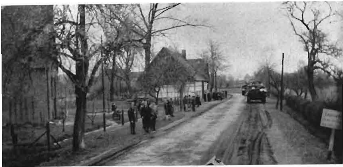
Convoy At Everswinkel, Germany

one command car and killed 5 Germans at RJ GC 4 and GC 77. Attacked the town of Le Mesle, knocking out 3 half tracks, 2 motorcycles, one Mark IV tank, took 3 prisoners and killed approximately 15 men. Road blocked the town until the column moved through and then proceeded on with mission, and to sum up an eventful day another command car was destroyed 2 miles east of Le Mesle.