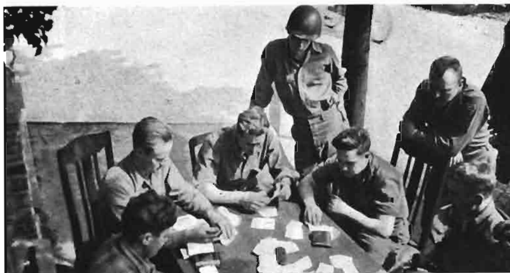
Card Game, Zweidorf, Germany

On arrival near Elkins, West Virginia, a period of particularly tough and vicious training began. Cold weather, deep snows and treacherous terrain combined, made this time a very memorable one. Another Army Ground Force Test proved the unit ready for combat.