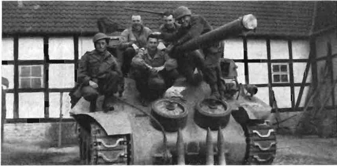
A Gun Crew on V-E Day, Zweidorf Germany