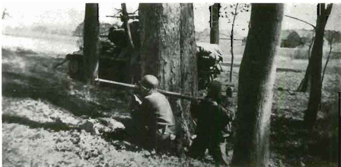
Firing The Bazooka At Road Block, Tangeln, Germany