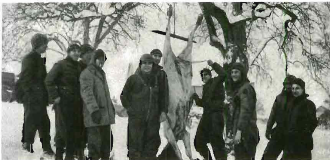
Butchering, Fosse, Belgium

On 6 February 1944 we landed in Scotland and proceeded by ferry, train and truck to Packington Park, in the vicinity of Coventry near Birmingham, England. While here we received new Tank Destroyers, trained for a while