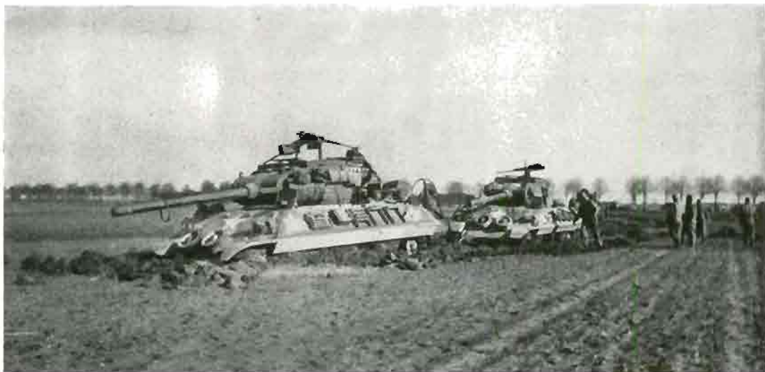
Pulling Into Firing Position, Near Ohrdorf, Germany

The arrival in France of Company "C" started what was to be a long list of firsts for this unit. The Headquarters, which consisted of 4 officers and