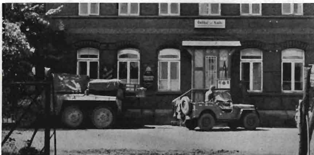
B Company C. P. At Zweidorf, Germany