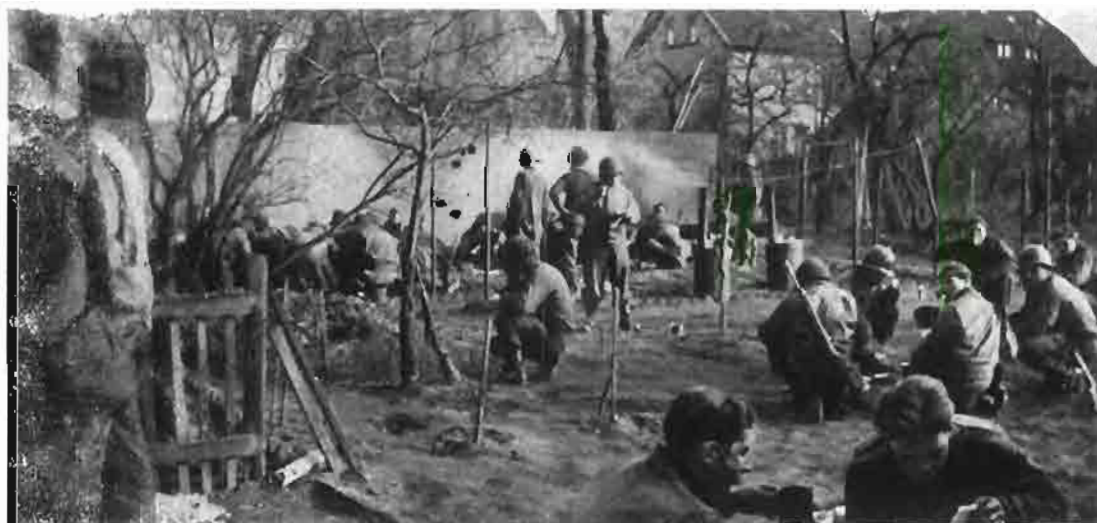
Chow Time At Lank Latum, Germany

pill boxes. We had road blocks north and south of the town and consolidated our positions for the night. From the way we went in it looked like the going was going to be easy. We moved through fog to attack Hommersdingen and Cruchten. Part of the company provided flank protection for the 10th Tank Battalion; the rest of the company remained at road blocks for CCR Headquarters. The objectives were taken and consolidated. On the 15th of September we were assigned with the 10th Tank Battalion the mission of taking Bettingen from the west. We moved through Stockern without contacting the enemy. On the outside of Oldorf we were met with intense enemy artillery fire from the south and east. We then moved back to Oldorf and consolidated our positions. All during the evening we were shelled. From 15 September to 19 September all positions were held against German counterattacks and artillery fire. Due to the distance that had been penetrated into Germany, it was not possible to attempt further movement until the flanks were protected. Orders to withdraw were given on 19 September. The third Platoon knocked out three tanks and suffered three killed and