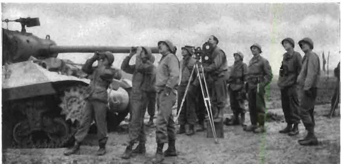
Shaef Photographers Near Voerendaal, Holland

August 10th found the company in a lone role while protecting the flanks of the main column. The following actions took place; captured 3 prisoners at RJ 1 C 75 and N 155. Captured 15 prisoners at La Perriere. Knocked out