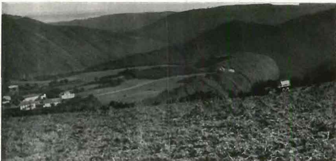
View North of Diekirch, Sept. 1944