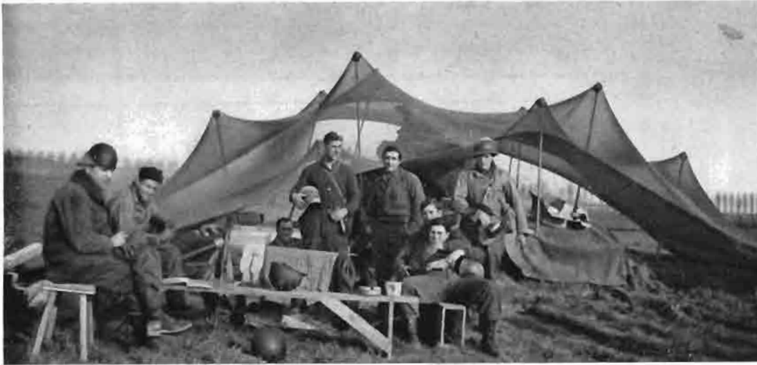
Time Off From Firing, Latum, Germany

one wounded, due to artillery fire; counterattacks were many. We withdrew to the vicinity of Diekirch, Luxembourg completing the assembly on the morning of 20 September. From 20 September to 28 October we did very little fighting, doing mostly road blocks and performing maintenance. We remained at Obr Forsbach, Germany. On October 29 we turned in our M-10 Tank Destroyers and were given M-36's. On 1st November the Company was given the mission of supporting fire of the 95th FA Battalion. We moved south of Kalterherburg, Germany. The 1st and 2nd Platoons secured positions and set up for indirect fire mission; the rest of Company stayed in assembly area near Camp Elsenborn. Poor weather hindered movement. Platoons stayed in position until 11 November. At that time they then moved by way of Eysen and Kettinis to bivouac area west of Wallhorn, Belgium. CCR was given the mission of supporting the 4th Infantry Division in the