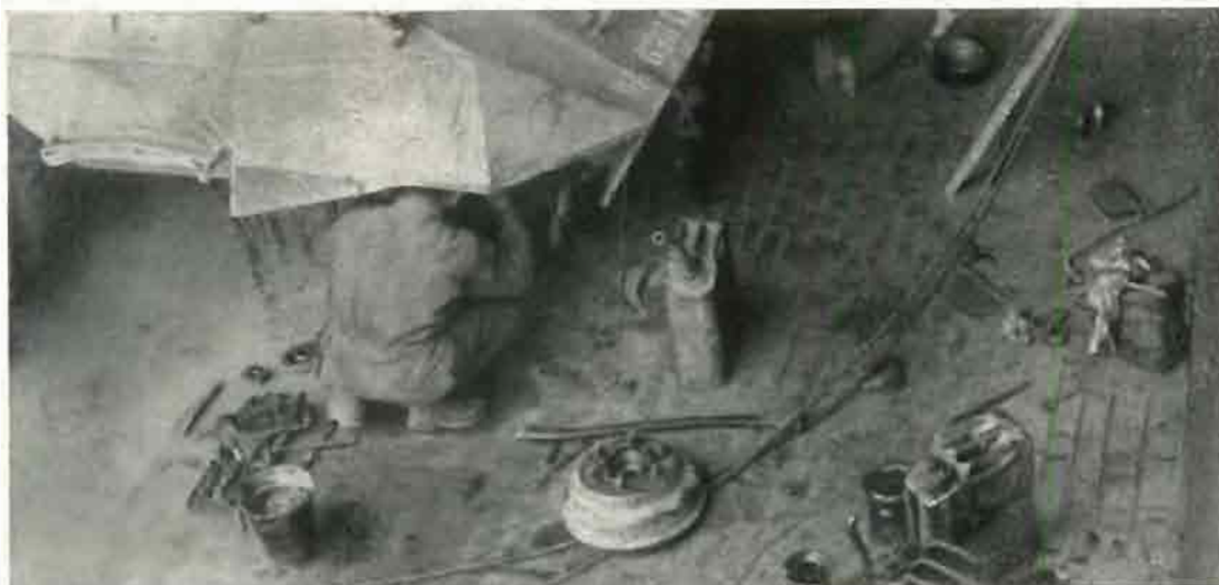
Maintenance At Work, Zweidorf, Germany