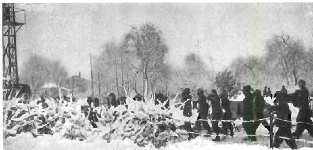
Prisoners Of War Near Fosse, Belgium

The battle for Hurtgen and surrounding towns turned out to be the bloodiest battle ever known. Both the enemy and our lines suffered heavy casualties. You couldn't find a tree in Hurtgen forest which wasn't marked by shell fragments. Our losses in the Company in deaths and casualties were heavy. In the battle for Hurtgen, on 6th December, we lost 10 men killed, 10 men wounded and one man missing in action. On 8th December we moved to a bivouac area at Rahrath, Belgium and rested up, performed main-