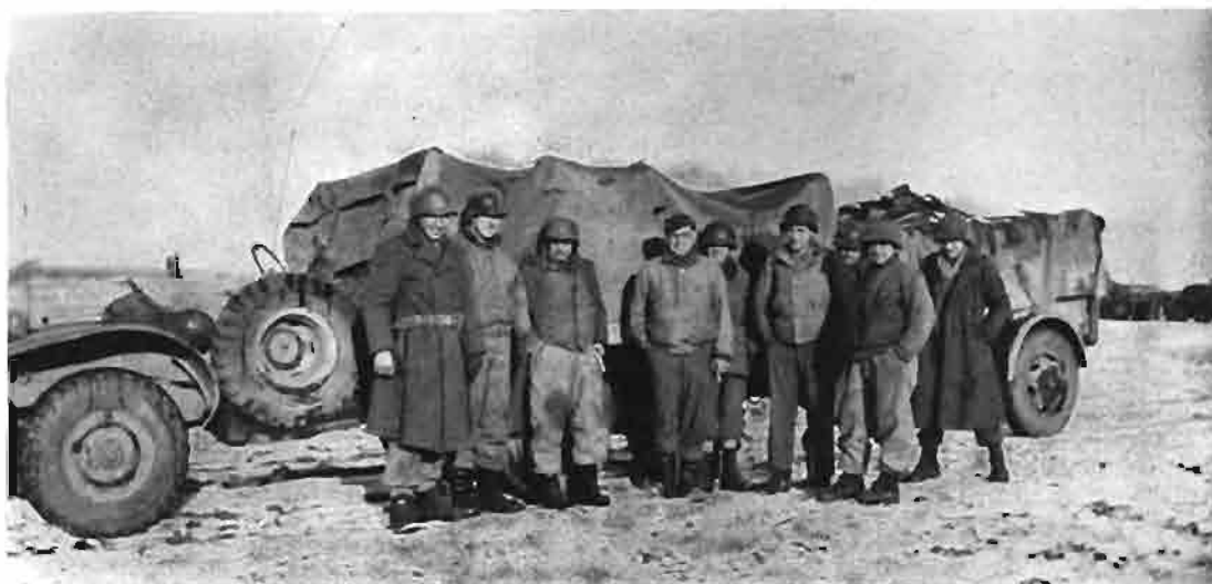
Security Section Near Voerendaal, Holland, January 1945

Platoon supported company from 15th Infantry in taking Exames and setting up road block. Aug. 14; Company attached to CCB located 2 miles Northeast of Sees. CCB's mission was to seize Dreux and the river crossing South of Eure river. Company moved with column, with the mission of providing protection against tank attack. The column continued its march. Aug. 15; Company pulled into bivouac area at Marville. 3rd Platoon assigned road block mission at Marville; 2nd Platoon attached to 71st Field Artillery for anti-tank defense, 1st Platoon attached to 95th Field Artillery for anti-tank defense. August 16: Supported 15th Infantry in attack on Dreux. 3rd Platoon road blocked Dreux from North; 1st Platoon plus one Infantry Platoon seized river crossing and Eure River bridge was blown up. No losses by enemy action. Company crossed river with CCB. 1st. Platoon attached to 15th Infantry; 2nd Platoon attached to 71st Field Artillery; 3rd Platoon in reserve. Aug. 17: CCB's mission was to set up road block two