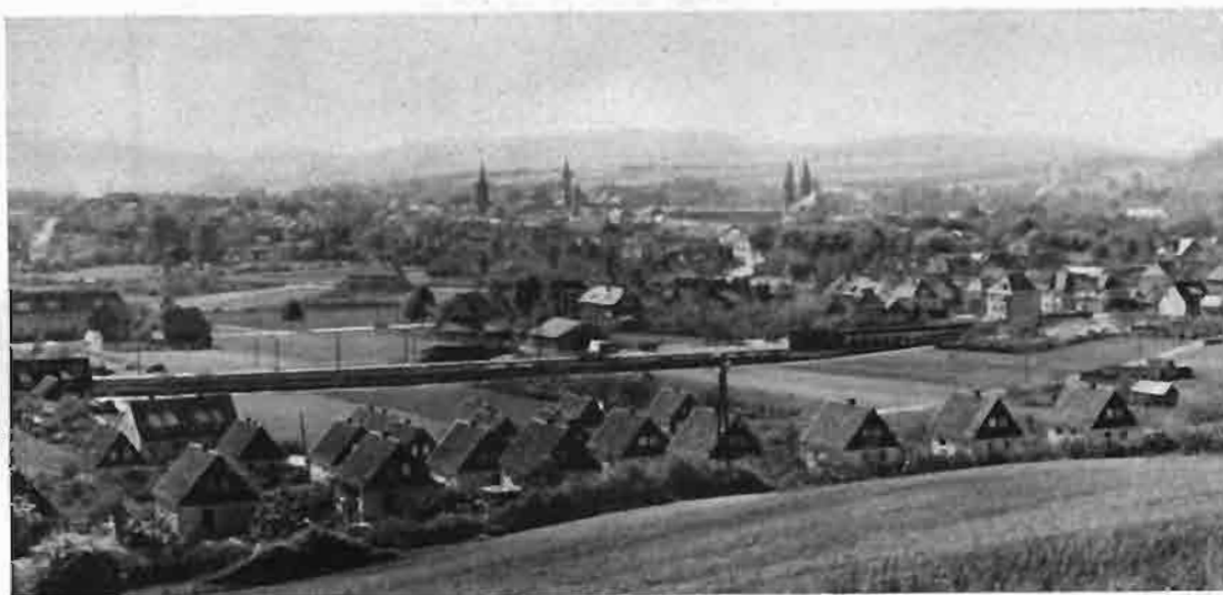
Heiligenstadt, Germany, May, 1945

The unit left bivouac on September 4th, and moved southeast with new missions toward the Meuse River. The following day the outfit was relieved from attachment to CCB and then attached to CCR, with the objective of taking Sedan from the enemy. While advancing, a body of Germans halted the column at the small village of Tilly, but supporting fighter planes took over and practically demolished the town, forcing the Krauts to wave the now familiar white flag.