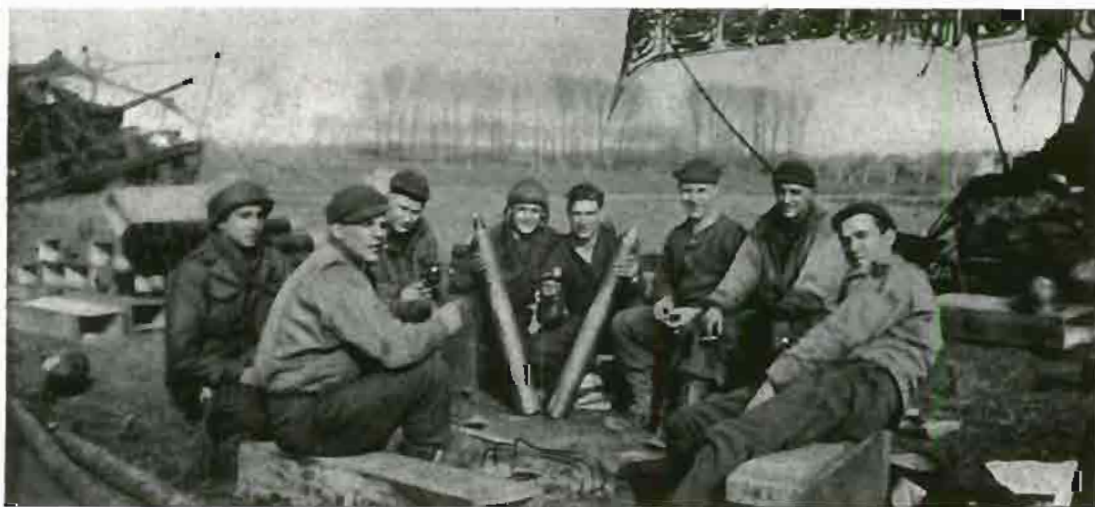
In Firing Position At Pufferdorf, Germany