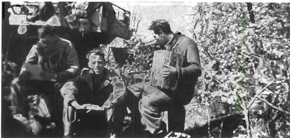
Lighter Moments In the Field. Near Ohrdorf, Germany

Early in June came the time for Company "B" to be marshalled and the organization moved to D-2, near Bournemouth. The vehicles were combat loaded, a general review of tactics and firing was had and a last we pushed off for the combat which raged less than 35 miles away. On the 28th of July we loaded aboard LST's for the Channel crossing and made the trip without incident. What lay ahead no man knew, but all were filled with excitement and for the first time the men felt that stirring in the bowels that was to become so familiar in the next ten months.