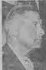
Swift, 1st Corps