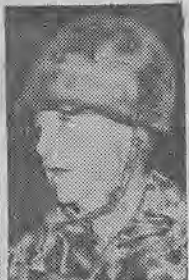
Wing, 43d Div.