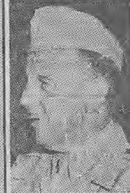
Brush, 40th Div.

Map above illustrates how Gen. MacArthur's armies split the Japs, sealed them off in four separated segments, while driving full speed ahead for Manila. (1) Japs in Luzon's northern mountains formed threat to rear and left flank of any U. S. forces driving south to Manila. Therefore, from the Lingayen beachhead, Maj. Gen. Innis P. Swift's 1st Corps (6th, 25th, 43d Divisions and 158th Regimental Combat Team) swung north and east to contain enemy in the northern area. (2) Maj. Gen. Oscar W. Griswold's 14th Corps (37th and 40th Divisions) swept south on road to Manila, protecting the right flank with parallel drive down coastal strip west of Zambales Mountains. (3) To protect right flank of 14th Corps spearhead and to seal off Japs in Bataan peninsula, the 38th Division and a 24th Division Combat team of Lt. Gen. Robt. L. Eichelberger's new 8th Army landed on the Zambales coast, drove east toward a junction with the Manila-bound 14th Corps. (4) Within 48 hours, another 8th Army landing was effected, by the 11th Airborne Division, at Nasugbu, 41 miles southwest of Manila. This put a pincer on the Philippine capital and sealed off Japs in south from coming to the aid of those in the north.