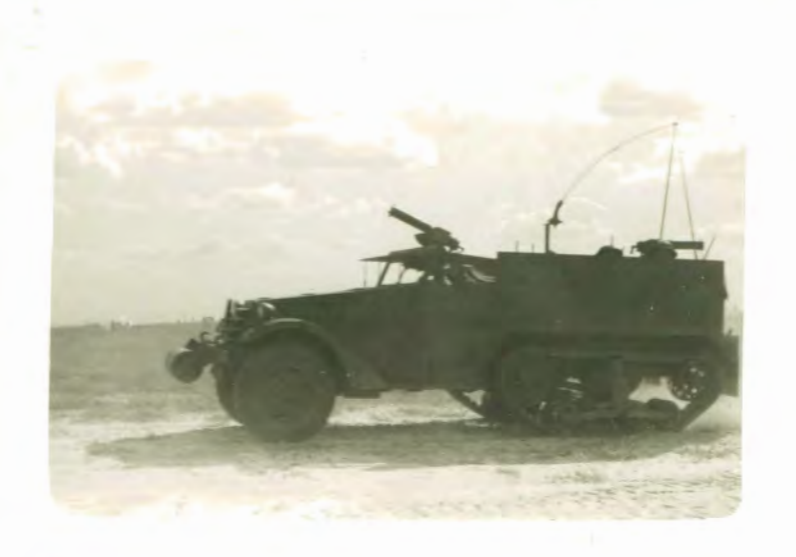
ARMORED HALF-TRACK, CREW OF FIVE, TOWED THE THREE INCH GUN