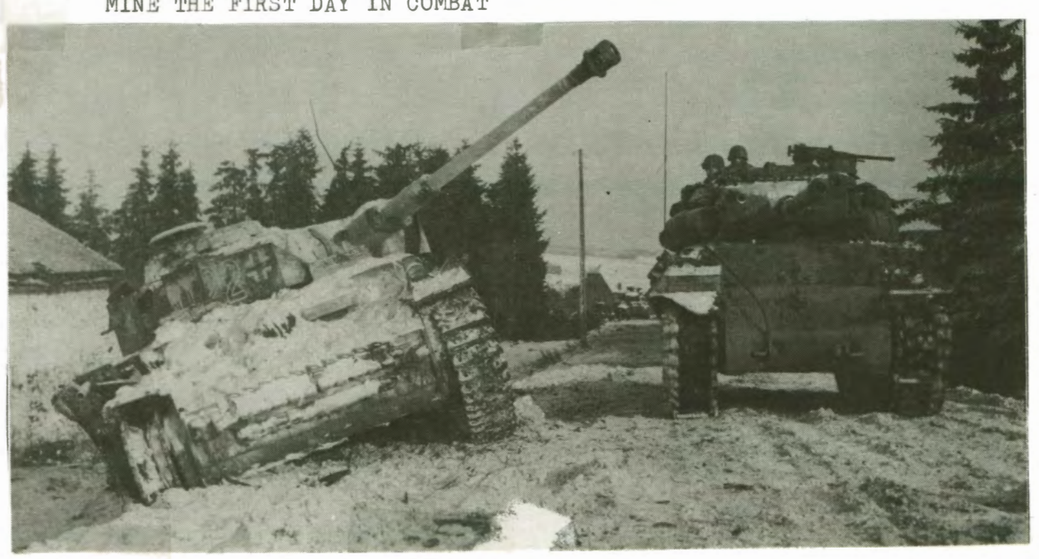
M-36 TANK DESTROYER PASSING A DISABLED TIGER TANK (GERMAN) DURING THE BATTLE OF THE BULGE