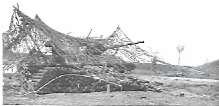
When in a reinforcing role, TDs fire far more than their usual complement of ammunition.

From the very first the 3" gun on the M-10 motor carriage very definitely sold itself to the destroyer crews who served it and the commanding generals who witnessed its devastating