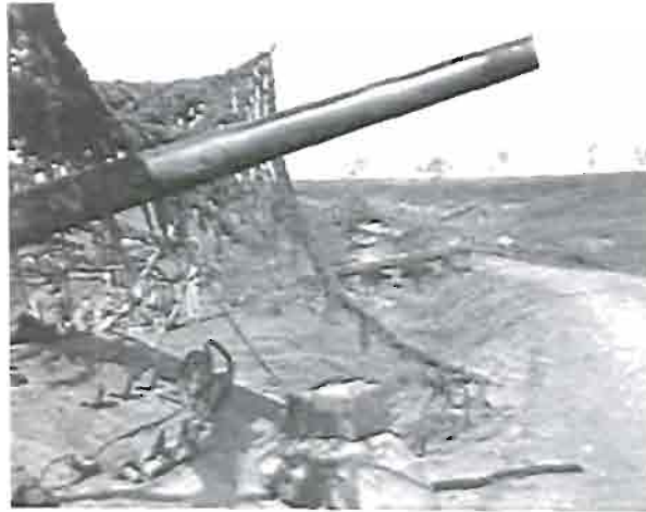
Virtues of a roadside position show clearly in this photo from the Littoria area of Italy. Muzzle blast will not show on the roadway, and extra elevation is readily had for increased range.

During this period we were careful not to advertise our training schedule. Quietly, almost secretly, we held class after class in indirect fire for officers and men. We also continued training in our primary role. Finally came the day for the proof of the pudding. We "snuck" out to the range. There were no visitors that day. It was hotter than the proverbial hinges, but that didn't faze the men. I never saw such enthusiasm.