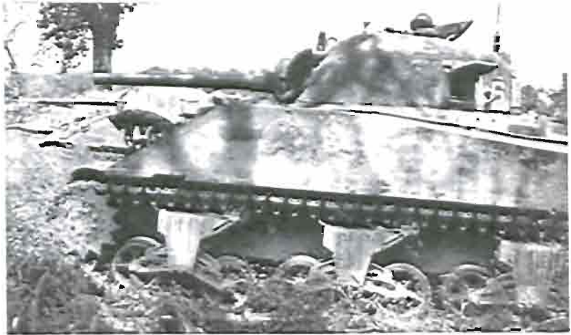
Tanks as well as TDs have been acting as reinforcing artillery. In this Italian scene note the spurt of flame from the second tank, which has just fired.

"During this phase of combat, when our positions were stable, the companies were regrouped into two 6-gun batteries instead of in the regular three tank destroyer platoons. This eliminated one supply point, one FDC, and one set of communication wires, and relieved one lieutenant for duty in forward OPs. We maintained our own company FDCs; the personnel consisted of the company commander and a radio operator, who doubled on the phone.