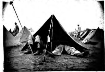
Style Show Fatigues