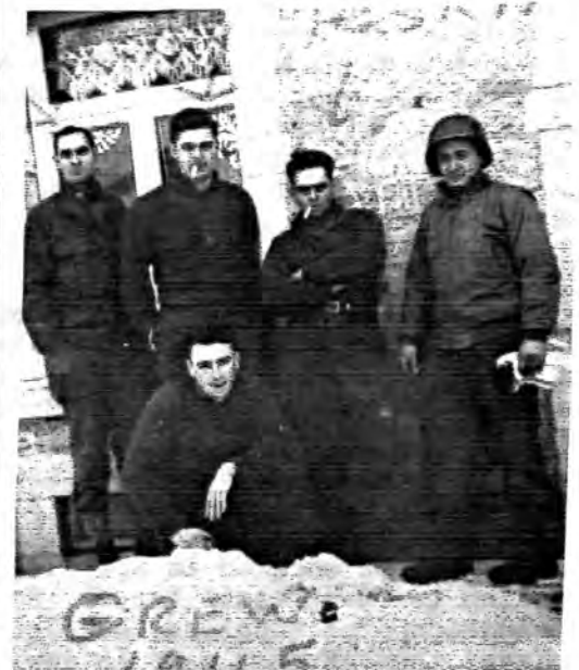
"C" Co. T.D. Crew Heskit in pic.