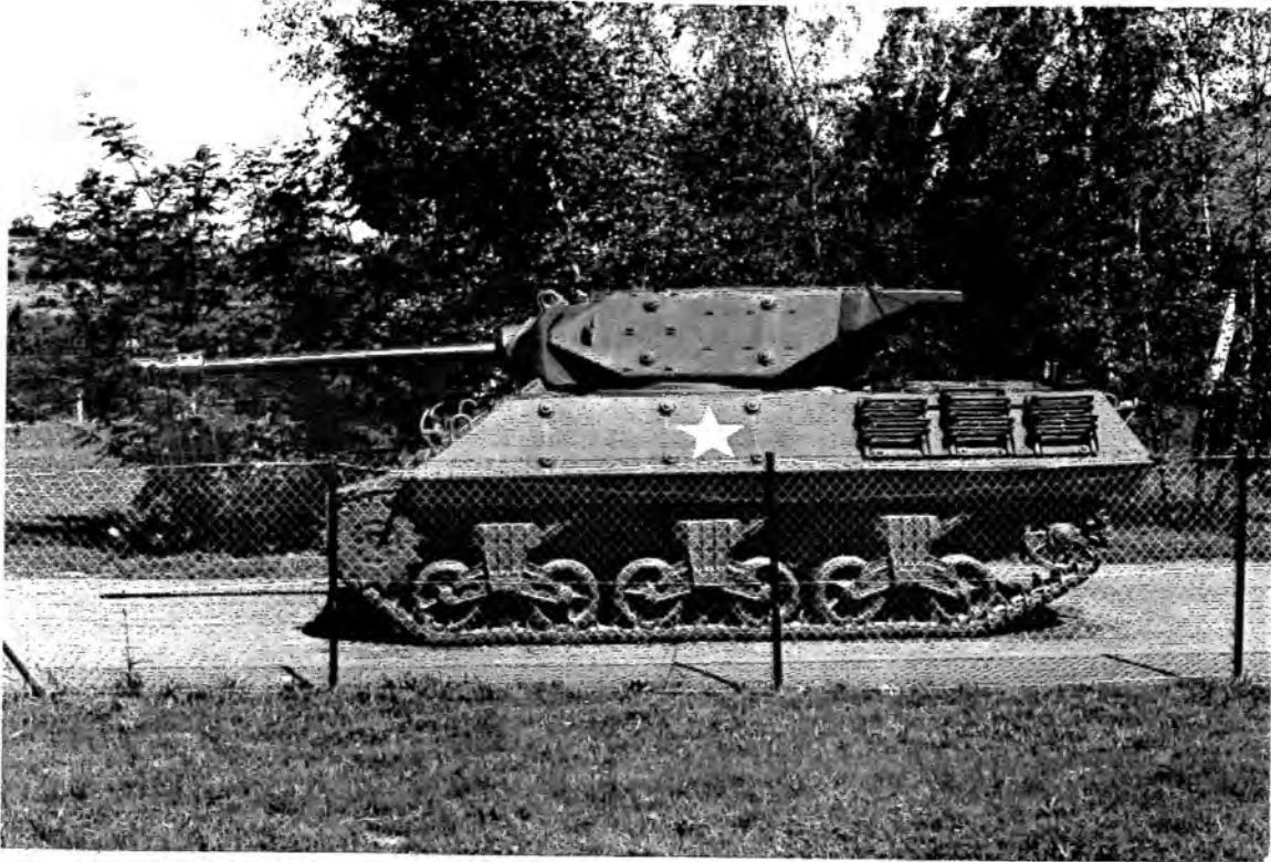
In our honor at the Bastogne (Belgium) Historical Center July 17, 1976