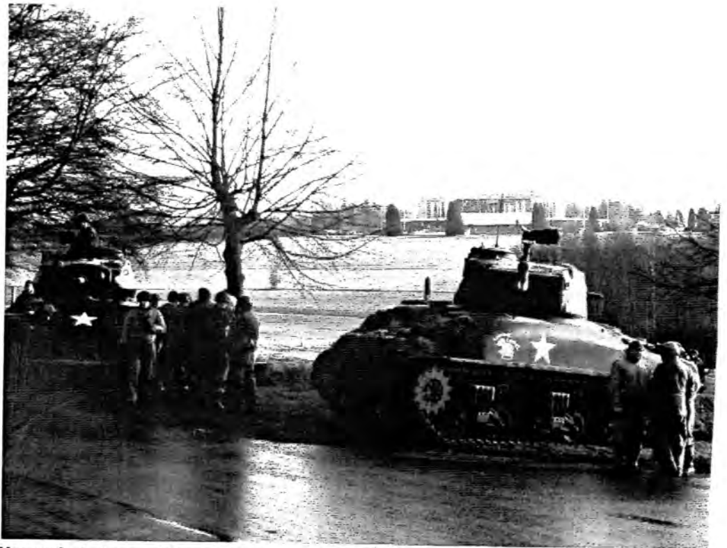
Memorial Day 12-17-1944 at Bastogne (Belgium) Historical Center to the rear.