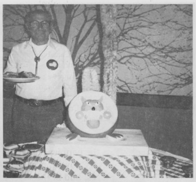
776 T.D. Emblem made of cheese