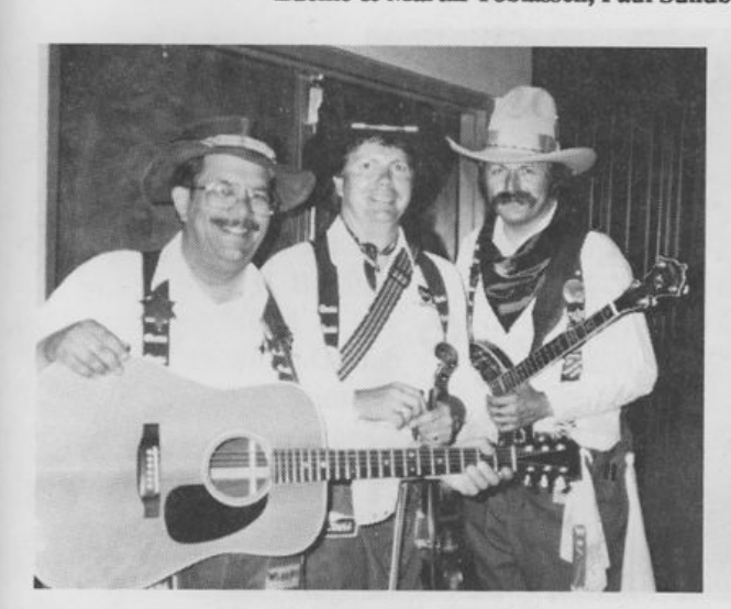
Entertainers at Reunion