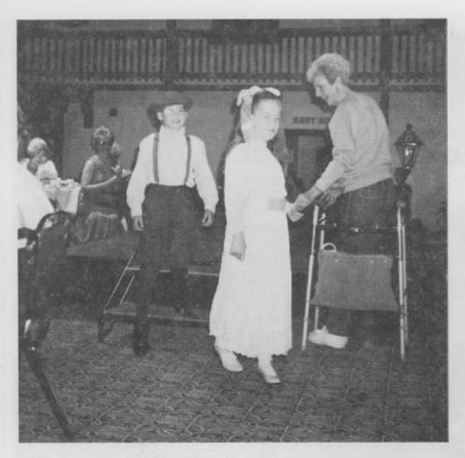
Fashion Show at Ladies Luncheon