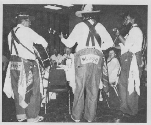
Entertainers at Reunion