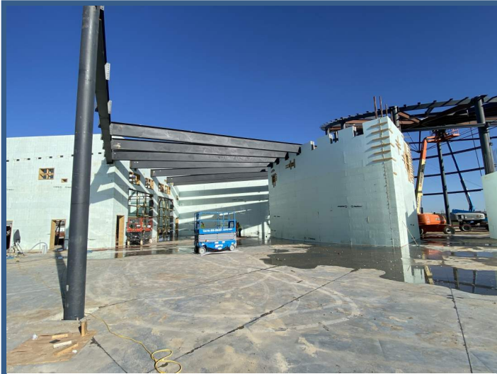
Steel Erection Section 2 & 3