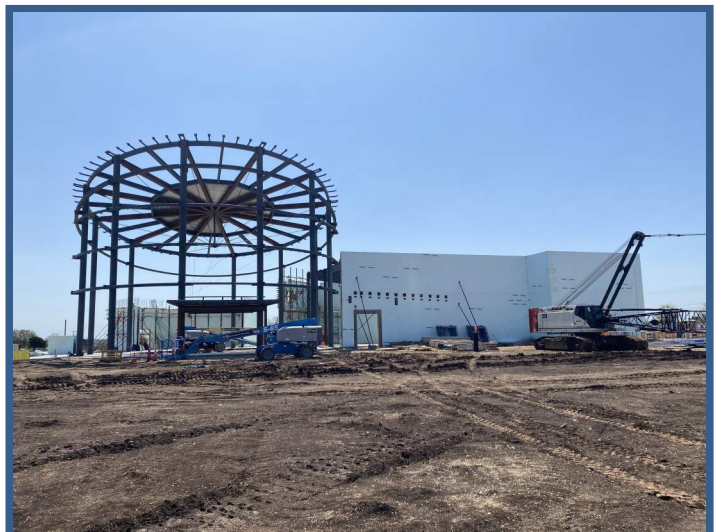
Overall View Facing Front Entrance