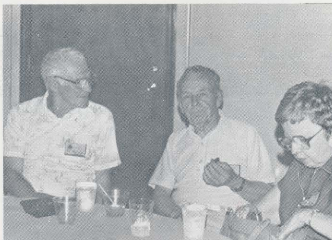
It's in her purse, she'll find it.