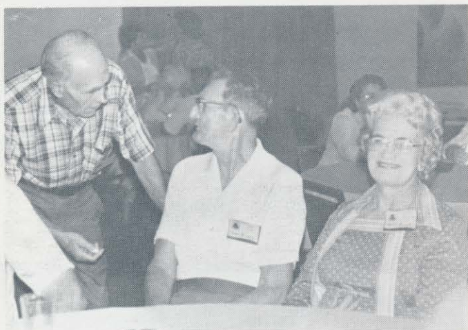
Cline, The Grimm's